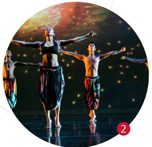
1. Mário Nascimento 2. Contempo Physical Dance